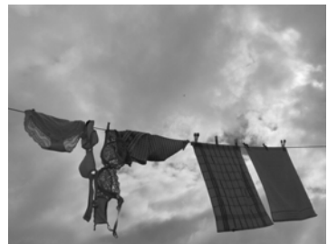
Sky Line Picasso - Stuart Ralph