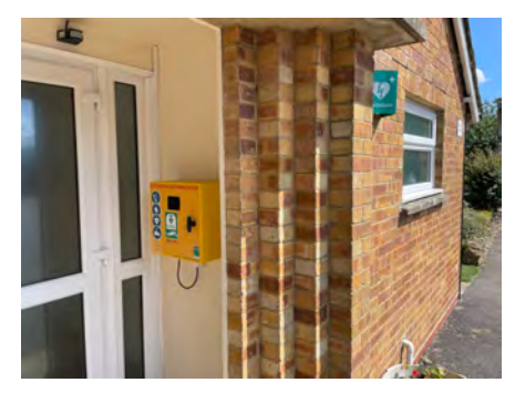
For the Gower side of the valley The SG defibrillator in the entrance to the village hall.

After ringing 999, you now have to give the exact location code for the defibrillator, using the free 'What 3 Words' app (details below)