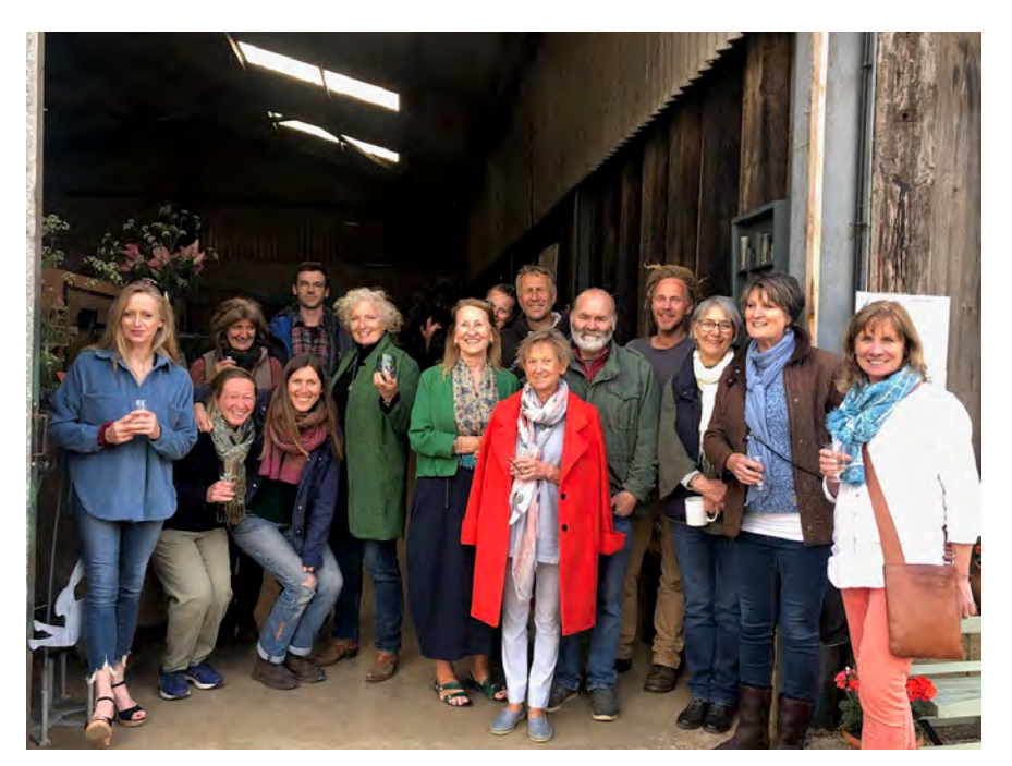
THE ARTISTS!!! From Artweeks at Temple Mill