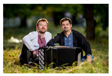
KYIV CLASSIC ACCORDION DUO