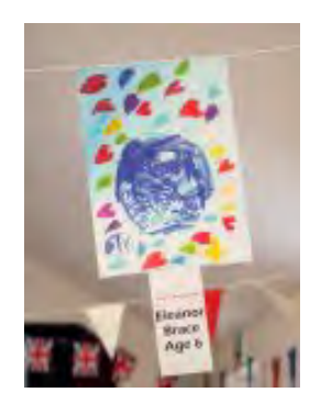
Eleanor Brace Age 6