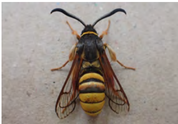
Lunar Hornet Moth