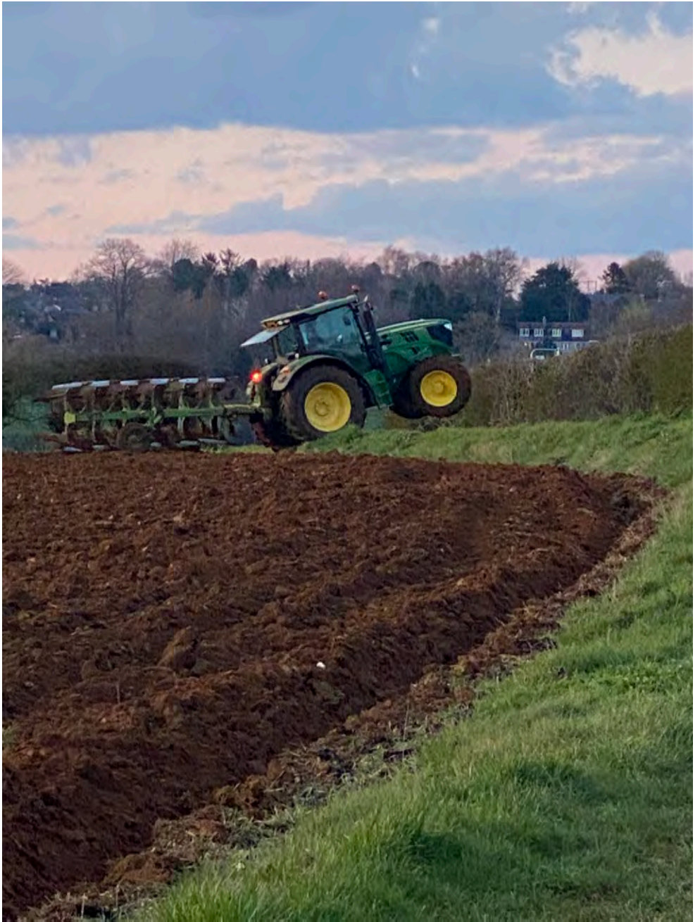
"Oops! " by Fiona Steane