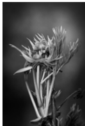
"Tree Peony" by Colin Lamb

This will be held at the Adderbury Institute on Saturday, September 25th between 10:00 am and 4:00 pm? There will be a wide range of excellent photographs on display including one of my own: