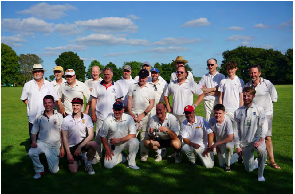
The "Swalford" Cricket Team- see page 33 for review