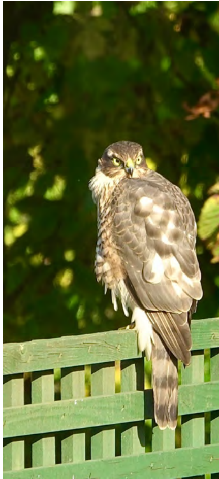
A sparrow hawk pictured in Sibford

MERRY CHRISTMAS AND A HAPPY NEW YEAR TO EVERYONE!