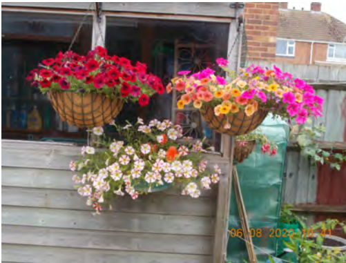
Couple of nice photos from Eveline Boughton

vaughanfletcher.co.uk madoc-art.co.uk ellydunfordwood.com