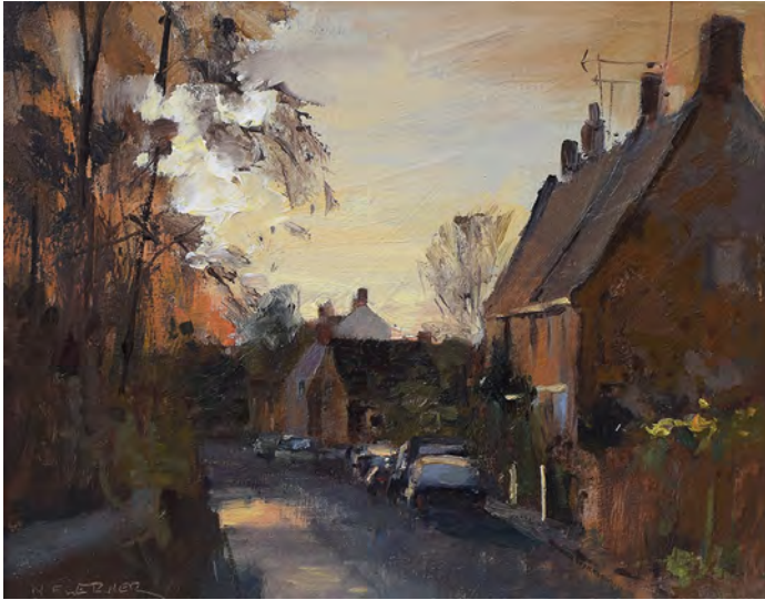
Painting by Nigel Fletcher