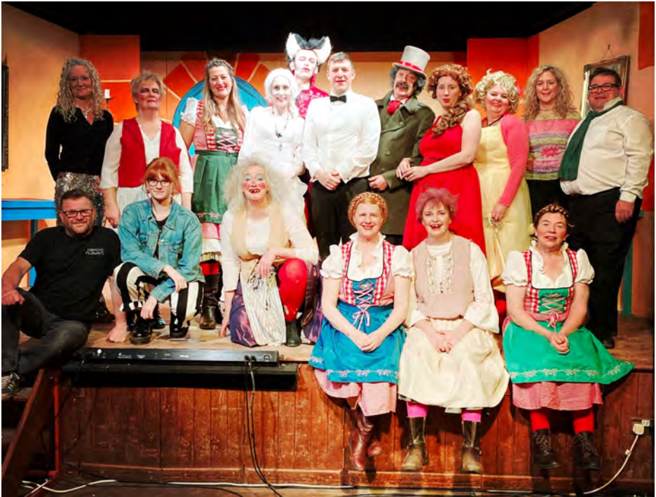
The Sibford Players are at it again..... "Garlic & Lavender"