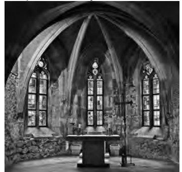
A Medieval Chapel

The ancient parish of Swalcliffe contained several small villages and was well documented because some of those villages contained extensive estates owned by abbeys and colleges. Swalcliffe Parish covered an area of 6946 acres. In the Middle Ages Swalcliffe Parish contained four Chapels, one in each of the four villages of Sibford, Epwell, Shutford and Swalcliffe. The Chapel of St John the Baptist at Sibford Gower was independent of the ecclesiastical parish church at Swalcliffe. By 1153, following the death of her husband, Agnes of Sibford granted its ownership and use to the Knights Templar. They retained the services of a priest to say prayers for her dead husband and kept the Chapel in good repair. In 1311, the Pope suppressed the International Order, due to alleged scandals and everything in their ownership was handed over to the Knights Hospitallers. By 1338 the Chapel at Sibford had passed to the Order of St John who looked after it for some 200 years. They paid an annual fee of £3.6s.8d to a chaplain to celebrate Mass three times a week for the souls of the departed and to make repairs as necessary to the Chapel.