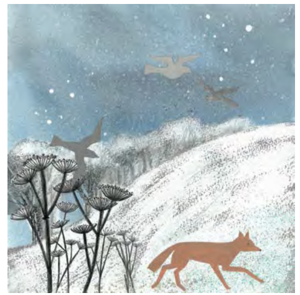
'Footprints in the Snow' by Nicola Durrant