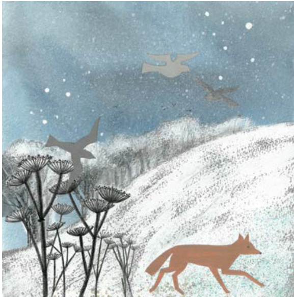
'Footprints in the Snow' by Nicola Durrant