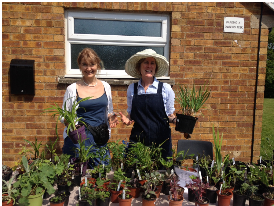
Having fun at the Horti Show.....