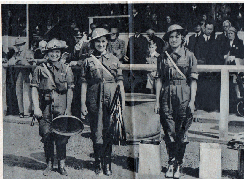
Many women will soon be doing Fire Guard duty for the first time, but there are thousands of other women who are veteran Fire Guards already; among them, this Devonshire team who were runners-up in the stirrup pump championship competition for their Region.