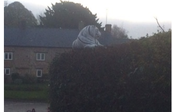
Fierce creature seen in Burdop.....

Proceeds in aid of Shutford Village Hall. Raffle in aid of The Children's Cancer and Leukaemia Group