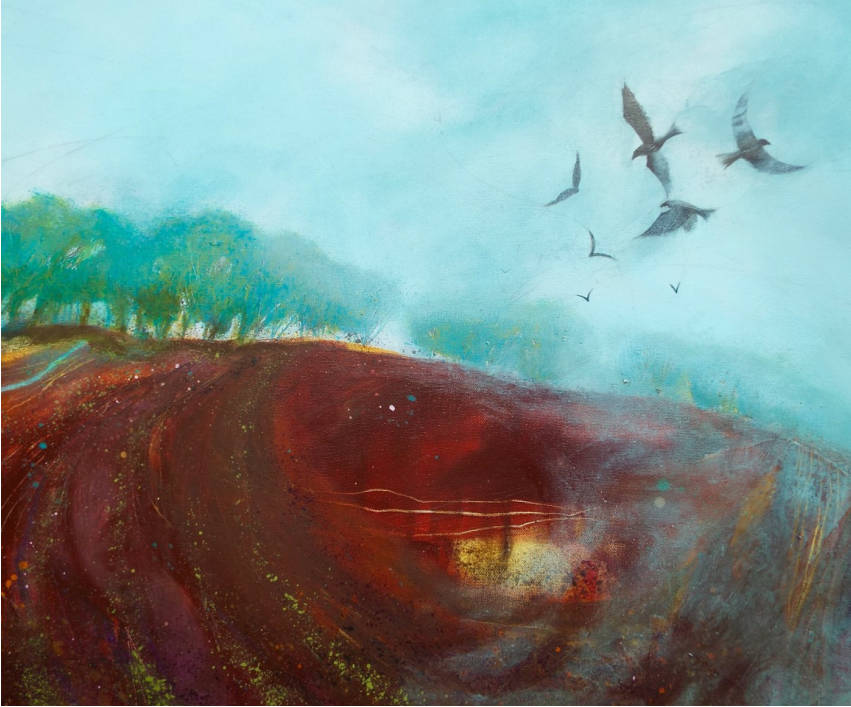
"Misty Morning on Ditchedge" by Nic Durrant