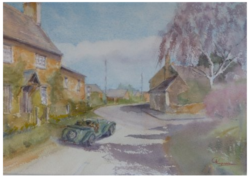
"Off for a Drive" - Painting by Chris Knapman

EASTER TEA PARTY (FRIENDSHIP CLUB) 4th April - Village Hall