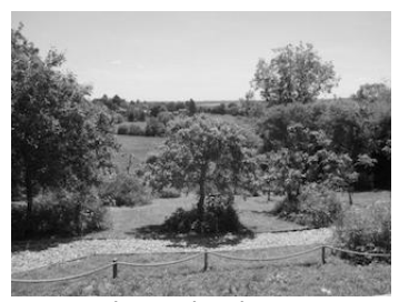
The Orchard Project

Following fairly recent developments in the outdoor spaces across the school site, such as The Orchard Project, we were assessed as a suitable venue for Forest School Leader training. From March, as well as training two of our own teachers, we are hosting teaching staff from schools across the Warriner Partnership who are coming to train in our beautiful school grounds. Let the den building and fire building commence!