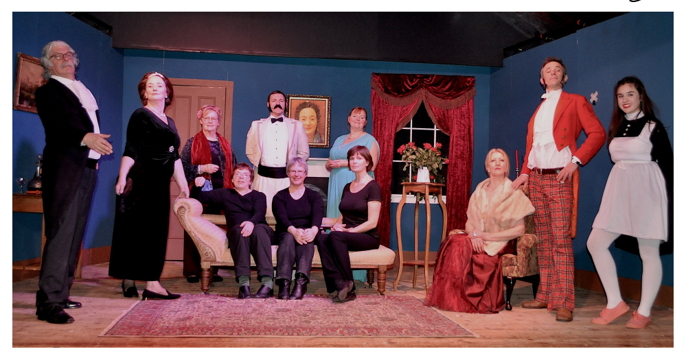
'Murder Most Foul' (Review - P13)

SIBFORD FERRIS PC MEETING 13th March - Sibford School Sports Hall 745pm