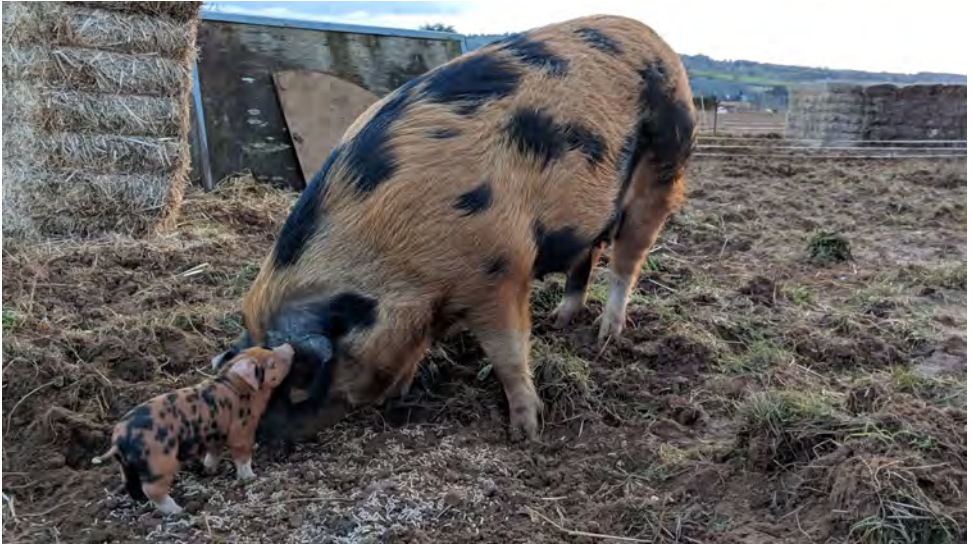
Welcome to the world, Rolo!