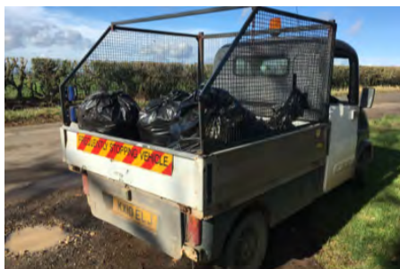
The result of the Litter Pick

A big thank you to the dozen people who turned out on the 2nd and to those residents that regularly help keep the Parish litter free.