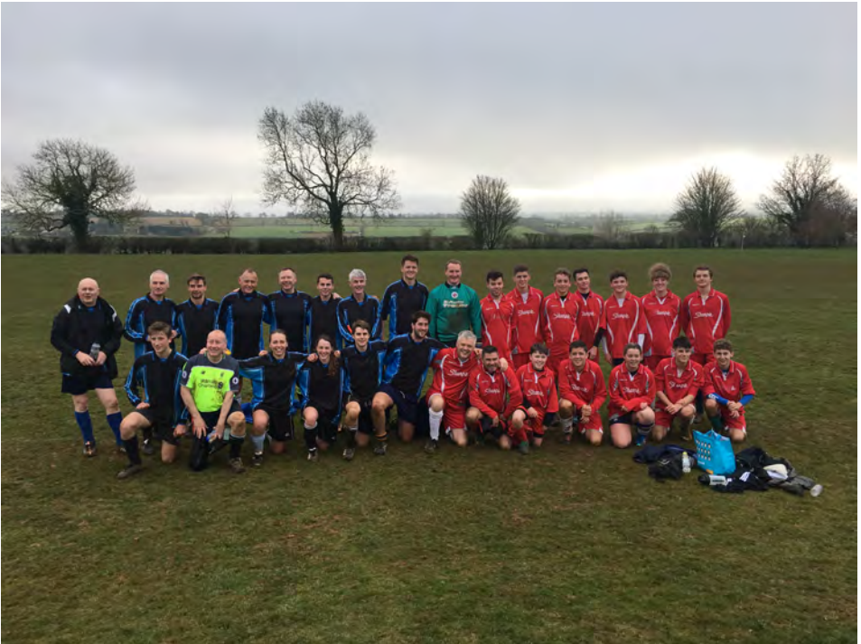
Sibfords Annual Football Match - The Teams!